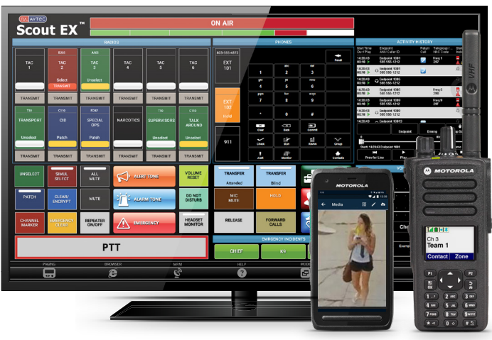
Avtec Scout Dispatch

Connectivity — across devices and networks — is an important part of ensuring you and your entire team are aware and informed at all times.