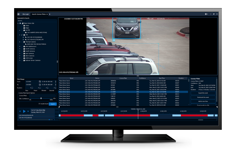
License Plate Recognition

All of this comes together to improve your situational awareness and help increase early risk detection.