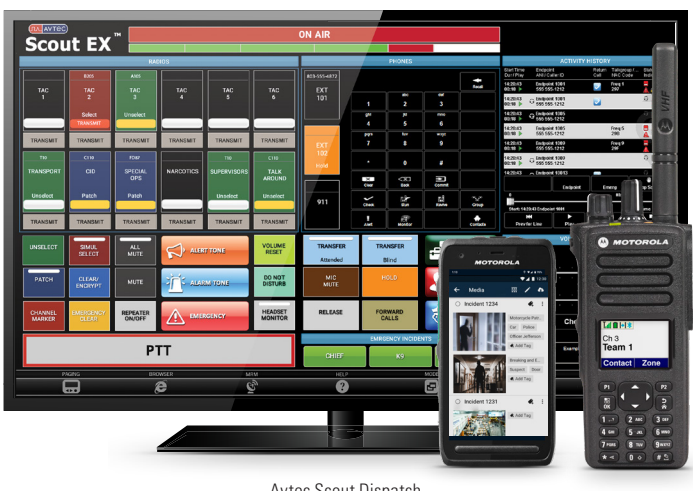
Avtec Scout Dispatch

Connectivity — across devices and networks — is an important part of ensuring you and your entire team are aware and informed at all times.