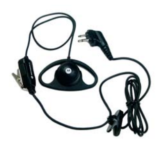
Earpiece with inline PTT & Microphone 56517