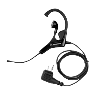
Earpiece with Microphone BDN6774A