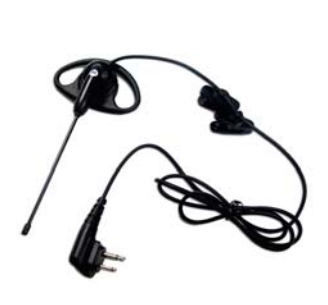
Earpiece with Boom Microphone 56518