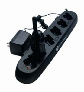
Multi-Unit Charger 56531